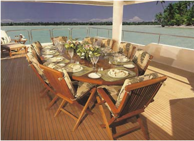
Upper Deck Dining