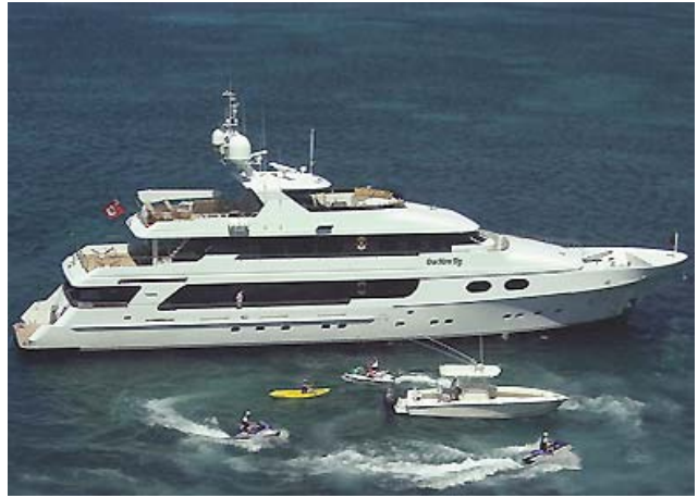
Aerial with Water Toys