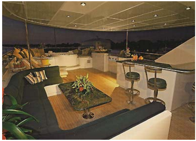
Upper Deck Bar