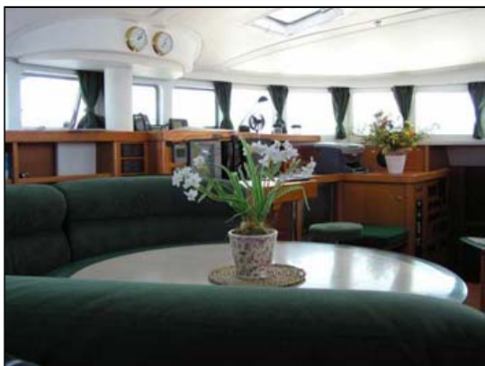
Main salon dining table