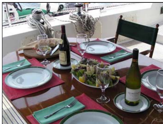
Cockpit Dining table