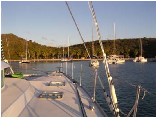
Pride at Honeymoon Beach