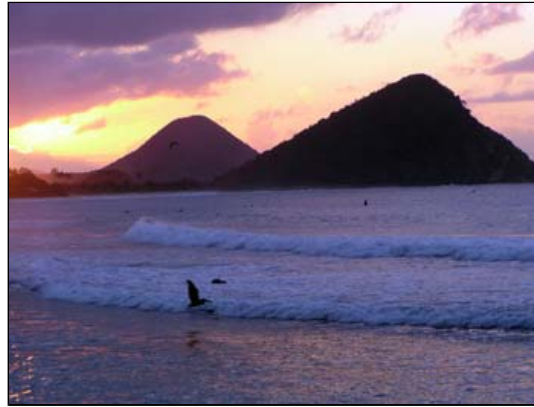
Dead Mans Bay