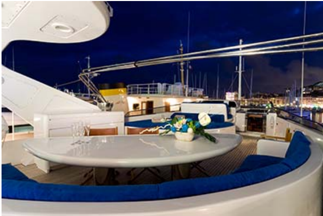
Al fresco dining