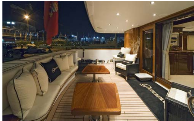
Aft main deck settee