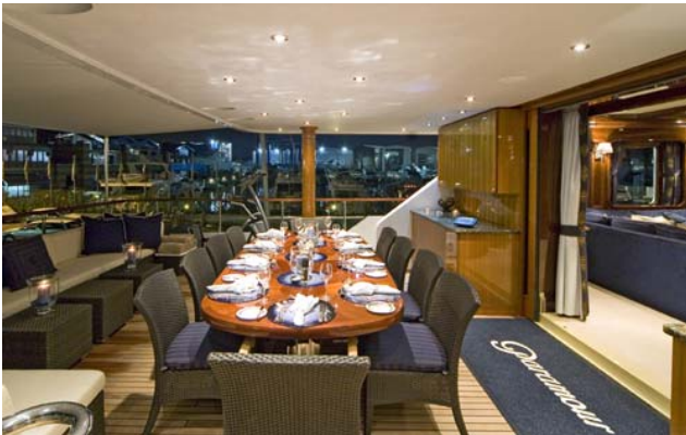
Aft upper deck