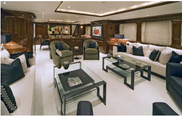
Main salon general view