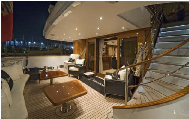
Aft main deck