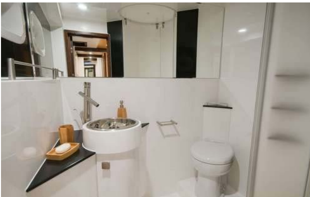
Bathroom with a separate shower