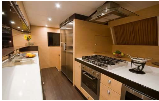
Kitchen and Bar