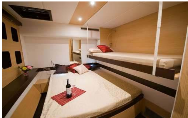
guest cabin details