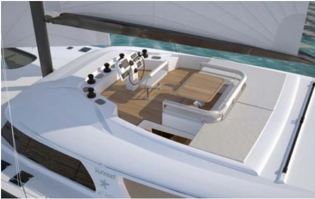
Flybridge - photos coming soon